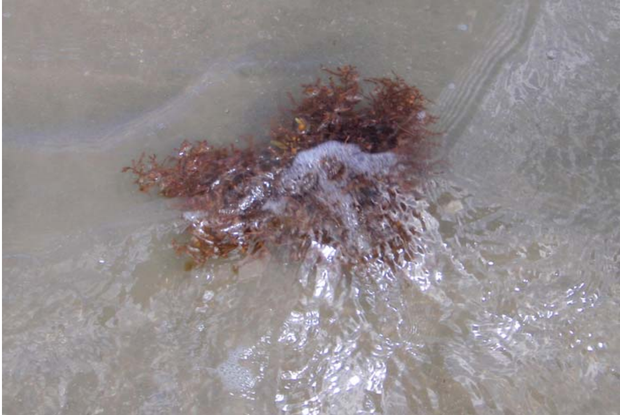
This small patch of Sargassum can host a multitude of aquatic life adapted to live in drifting ecosystems.

tween those pincers, it's lunch. The other shrimp, Hippolyte zostericola , is less aggressive. It's small