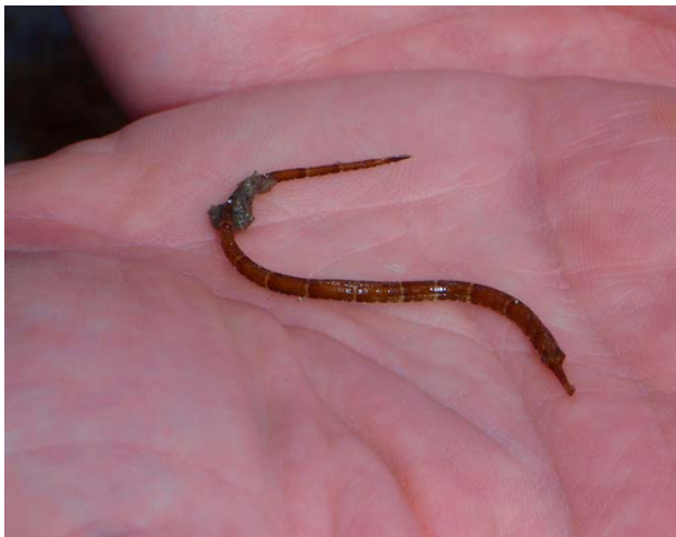
A small pipe fish found in a Sargassum clump in Galveston Bay.

(keep them away from go-bies) and there is nothing big enough to eat them.